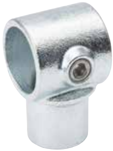
674-706HC | 1-1/4in